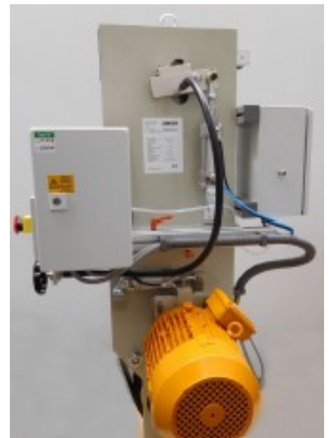
Control box option