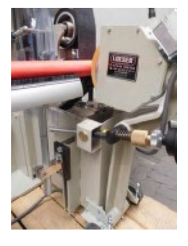
Support rail height adjustable