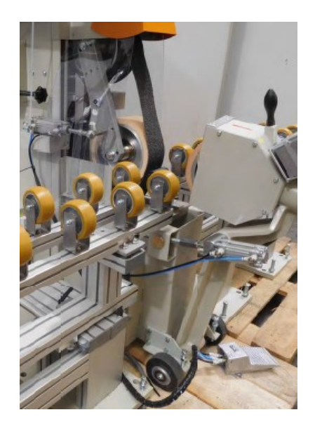
Pneumatically supported contact wheel & BA