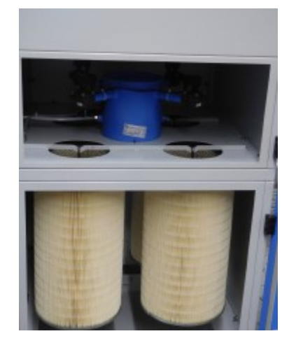
Cartridge filter with compressed air pulse cleaning