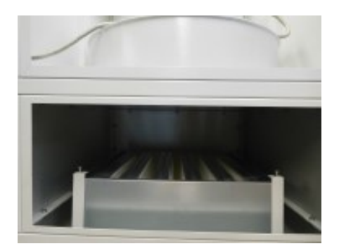
Absolut fine filter Filter class H 12, H 13, H 14