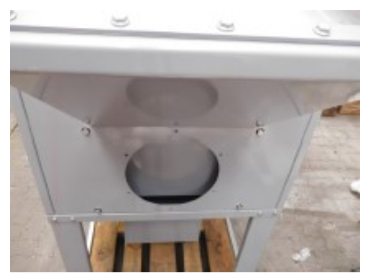
Internal spark baffle