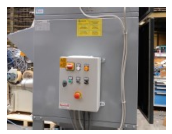
Control box for machine coupling