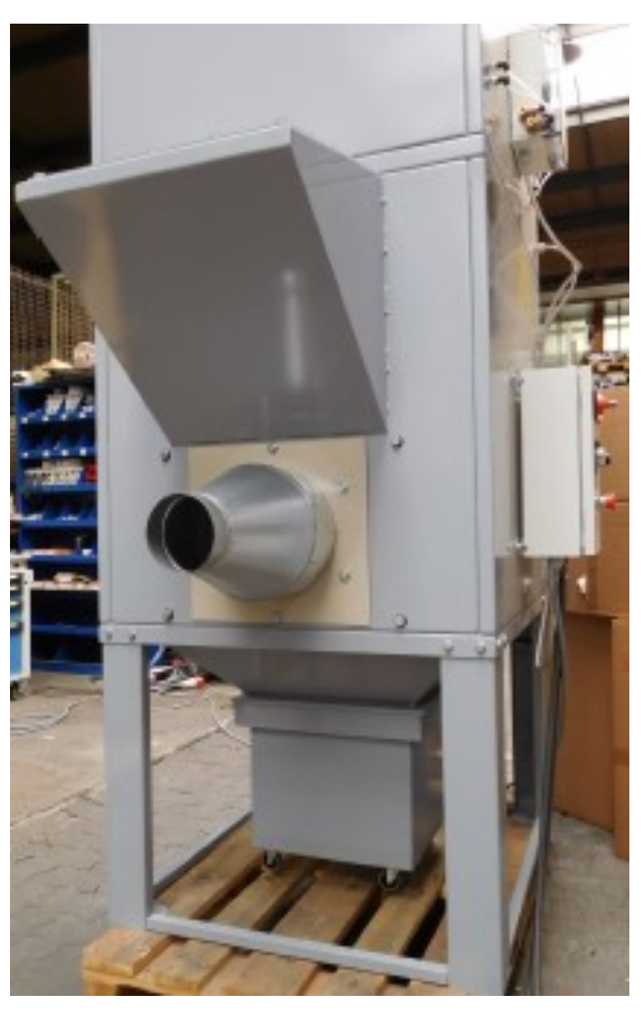
Pressure relief flap of the extraction for aluminium dust